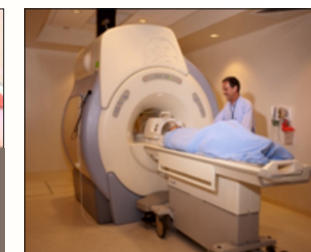
Nuclear imaging with MRI