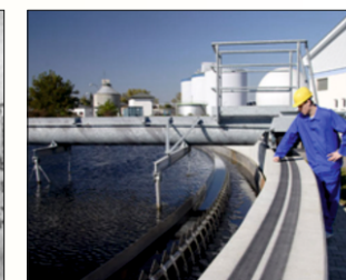
Waste water treatment plant

Department of Applied Physics, VNIT, Nagpur